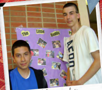
LEAP Project students Oklahoma City Public Schools