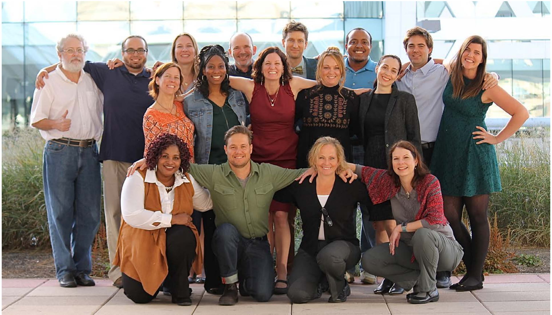
AASHE Staff 2016 Annual Conference & Expo