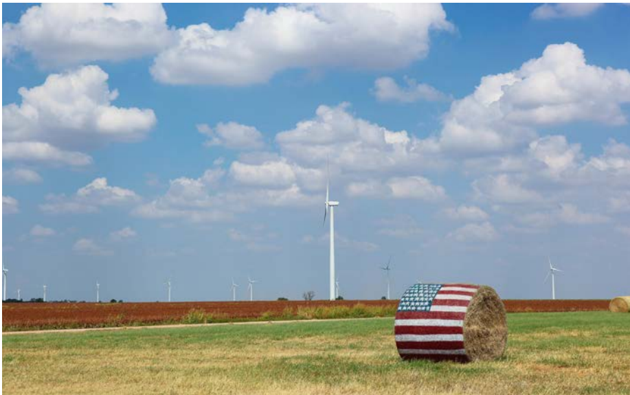
Chisholm View Wind Farm

Oklahoma has enjoyed the benefits of Enel Green Power for over 10 years. Enel Green Power's Oklahoma portfolio exceeds $3 billion in investment, with the creation of over 130 long-term jobs. NOC is proud to be a partner with Enel as they bring clean energy and high paying jobs to Oklahoma.