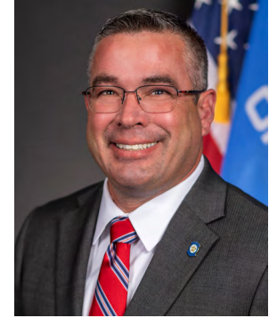
REP. CHRIS BANNING R-Bixby

Data from the National Center for Education Statistics show Oklahoma universities have the 8 th -lowest cost of attendance in the nation .