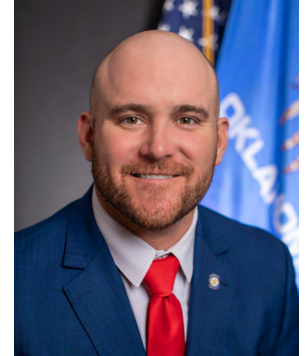
REP. TREY CALDWELL R-Lawton