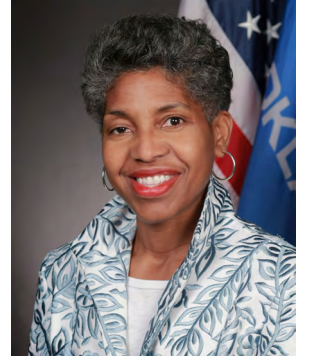
REP. REGINA GOODWIN D-Tulsa