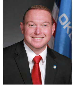
REP. T.J. MARTI R-Broken Arrow

Data from the National Center for Education Statistics show Oklahoma universities have the 8 th -lowest cost of attendance in the nation .