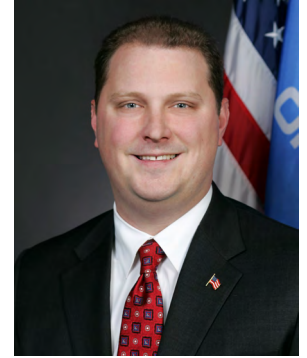
REP. JON ECHOLS R-Oklahoma City