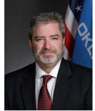
SEN. ROB STANDRIDGE R-Norman

Data from the National Center for Education Statistics show Oklahoma universities have the 8 th -lowest cost of attendance in the nation .