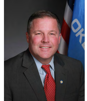
SEN. LONNIE PAXTON R-Tuttle