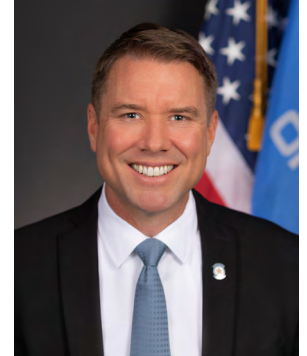
SEN. JOE NEWHOUSE R-Tulsa