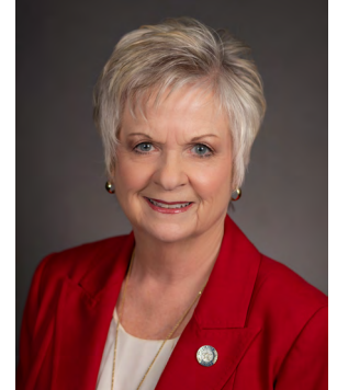
SEN. JULIE DANIELS R-Bartlesville