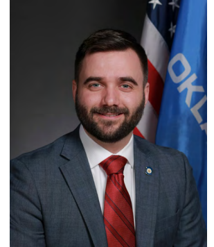
SEN. NATHAN DAHM R-Broken Arrow

Data from the National Center for Education Statistics show Oklahoma universities have the 8 th -lowest cost of attendance in the nation .